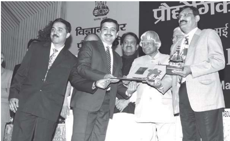
SGL received "National Award" for the Successful Development & Commercialization of Indigenous Technology by "Technology Development Board (Department of Science & Technology)", Government of India. The award was presented by former president of India Dr. A P J Abdul Kalam on Technology.