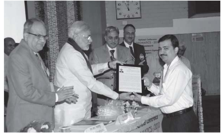
National Geomatics Award for Technology for 2009 to development of IGIS 1.0 from Chief Minister Mr. Narendra Modi. The award was conferred by Indian Society of Geomatics (ISG).