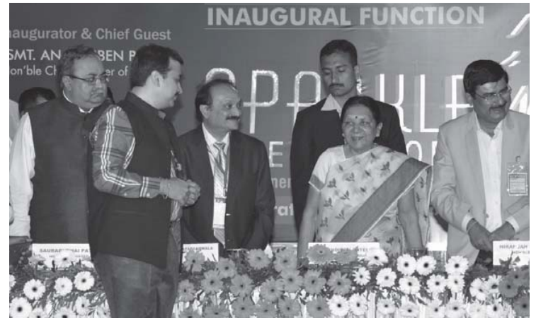
A GIS Portal launched by Hon. Chief Minister Smt. Anandiben Patel, Gujarat state, which is Developed by Scanpoint Geomatics Ltd. for Surat Municipal Corporation.